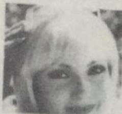
Carita de ángel

6:00 A.M. Matutino Matinal 9:30 A.M. Cine Familiar 11:00 A.M. Telenovela El Diario de Daniela 12:00 M. La Opción de las 12 1:30 P.M. Noti-5 primera emisión 2:00 P.M. Telenovela Carita de ángel 3:00 P.M. Por un beso 4:00 P.M. Primer amor 5:00 P.M. El precio de tu amor 6:00 P.M. Primer Impacto 7:00 P.M. Noti-5 segunda emisión 8:00 P.M. Telenovela Abrazame muy fuerte 9:00 P.M. Mi destino eres tú 10:00 P.M. El Show de Cristina 10:50 P.M. Resumen de Noticias 11:00 P.M. Quédate ahí 12:00 A.M. Lo mejor del cine 2:00 A.M. Largo Metroje 3:30 A.M. Noticias Eco